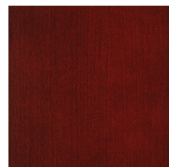
Red Walnut (Standard)